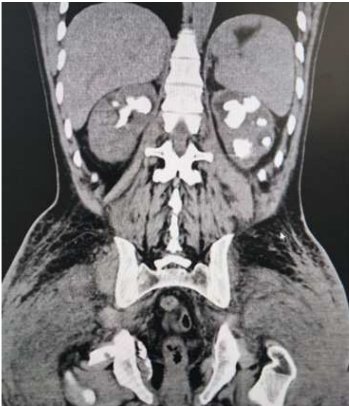
Figure 1. Abdominal/pelvis CT showing bilateral staghorn calculus and hip silicone material.

13 mmol/l, ionic calcium 1.54 mmol/l, total calcium 11 mg/dl, albumin 3.3 mg/dl, intact parathyroid hormone (iPTH) < 3 pg/ml, 25-hydroxyvitamin D 18 ng/ml, phosphorus 5.8 mg/dl, alkaline phosphatase 168 U/L. The HIV, hepatitis B, and hepatitis C serology were negative, and serum protein electrophoresis was normal. The urine test revealed a density of 1008, pH 6.5, traces of protein, five (5) red blood cells per field, numerous leukocytes, and no bacteria. The abdominal tomography showed bilateral staghorn calculi hip silicone material. (figure 1). The static and dynamic renal scintigraphy