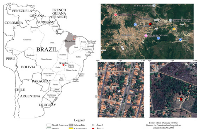
Figure 1. Map of the study area.